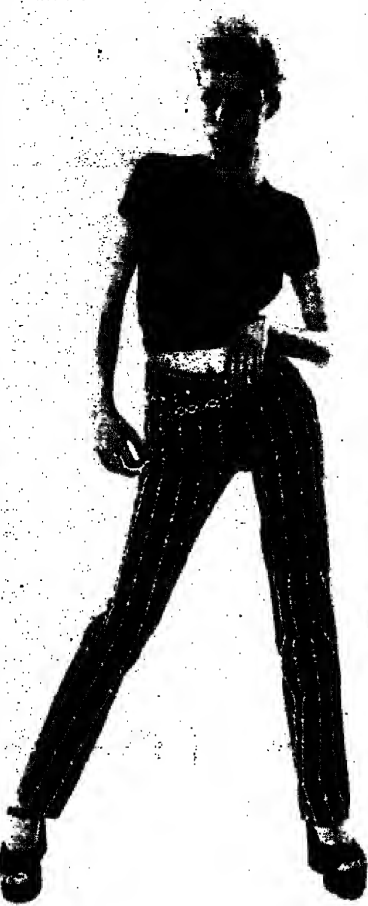
Onyx plaid pants and cropped tee-shirt from Hamashbir.

Several companies which supply Hamashbir have included the slim, but not tight-fitting, sleeveless dress.